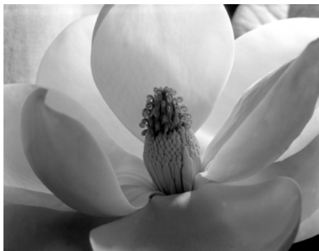
Imogen Cunningham (American, 1883 – 1976). Magnolia Blossom, 1925, gelatin silver print